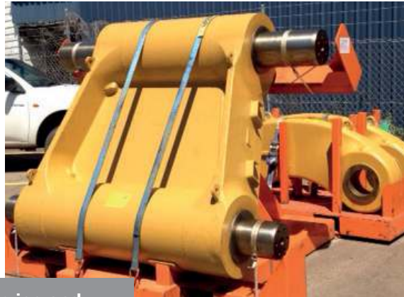
Service and Exchange Parts