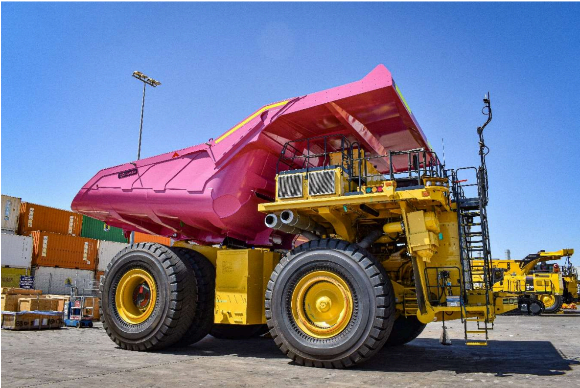
Austin's newly-launched lightweight HPT Truck Tray has been designed and manufactured in Western Australia