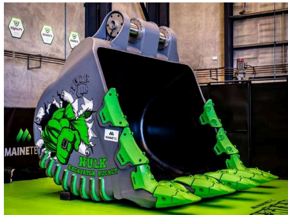
The full range of Austin and Mainetec excavator buckets are being manufactured in Perth