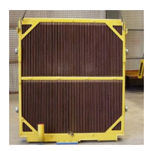
Industrial cooling and heat transfer systems (COR Cooling)