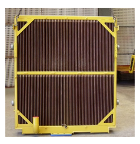
Industrial cooling and heat transfer systems (COR Cooling)