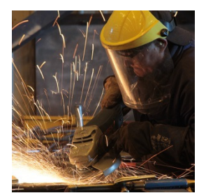
Equipment repair and maintenance