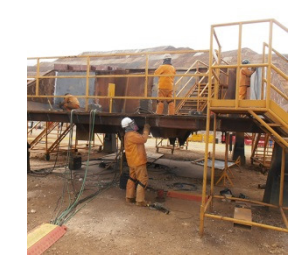
On-site maintenance and shutdown services (Pilbara Hire)