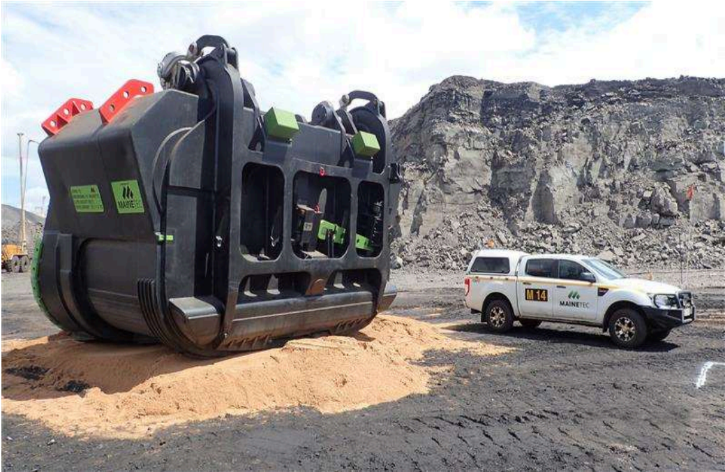
Mainetec's dipper bucket

Contacts: AUSTIN ENGINEERING LTD Head Office | ABN 60 078 480 136 100 Chisholm Crescent, Kewdale WA 6105, Australia P +61 8 9334 0666 E investorrelations@austineng.com.au W www.austineng.com