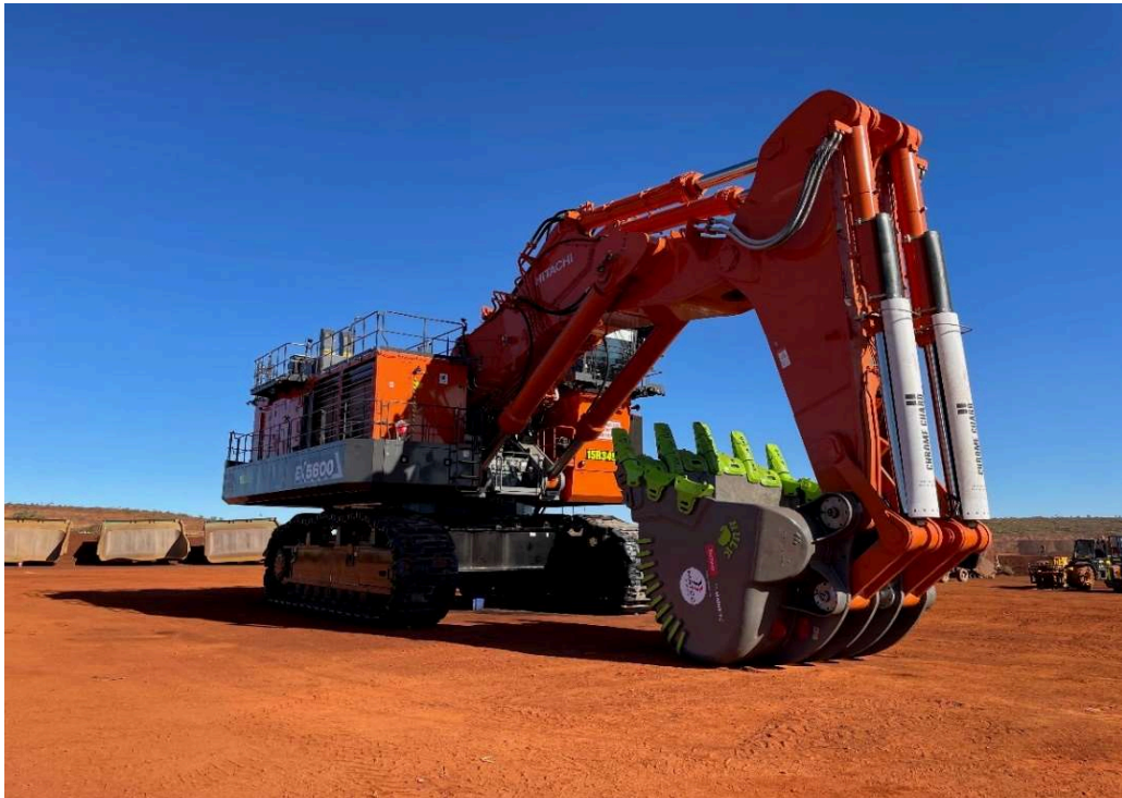
Mainetec's high performance Hulk bucket